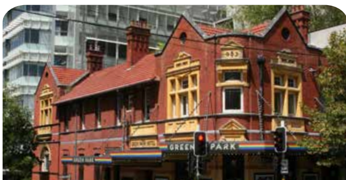
Green Park Hotel will be developed into the welcoming St Vincent's Urban Health Hub

Envisioned as a welcoming, friendly, non-clinical space, the health hub will provide holistic health navigation with referrals to St Vincent's and external partners. It will serve as a supportive resource for information and education on prevention, recovery and wellness for some of our most vulnerable patients. They can choose from face-to-face support, digital engagement, and virtual health programs state-wide, delivered via a dedicated webinar studio.