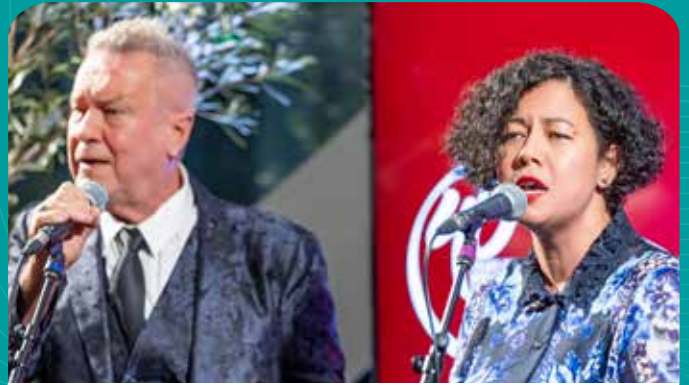
Jimmy Barnes AO and Mahalia Barnes

We were delighted to announce major donations to support the redevelopment of the hospital's Interventional Cardiology Suites, including visionary contributions from the Sutton Family and the JW & M Cunningham Foundation. We thank both families for their extraordinary support.