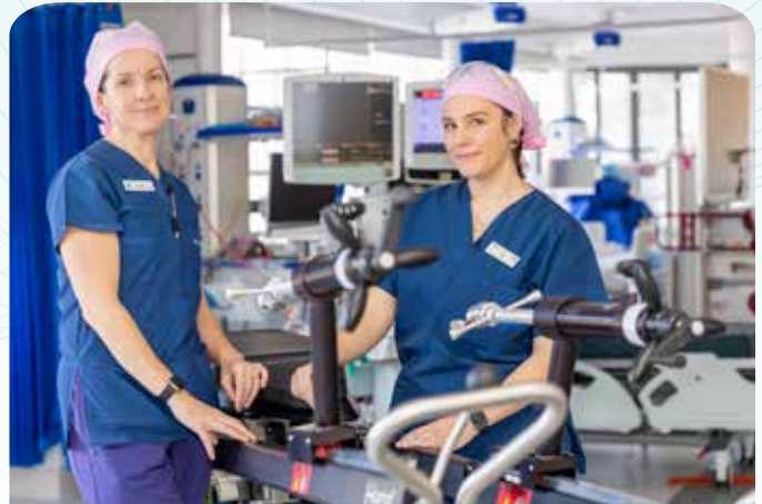
Surgical nurses with the Hana Orthopaedic Surgical table